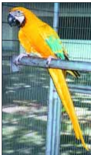
Nolito Manuel C. Jardinel

The use of Harrison's premium, certified organic, formulated bird foods can help maintain the bird's health while leading to improved results in treating bird diseases. Following are some examples of clinically tested applications.