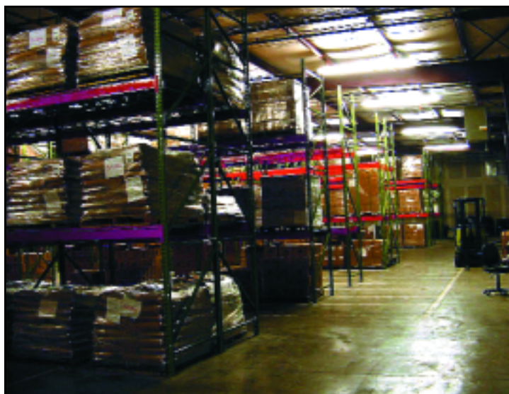
Exterior and interior of the new Harrison's Bird Foods warehouse in Brentwood, Tennessee.