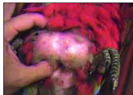
Massively obese scarlet macaw showing fat deposition in abdomen.

So, while a balanced diet may minimize the potential for a bird to develop FLKS, if the ingredients are sourced from nonorganic sources, certain birds may still be susceptible to developing the disease. The best way to prevent FLKS in pet birds is to provide a nutritionally balanced diet that is composed of organic ingredients.