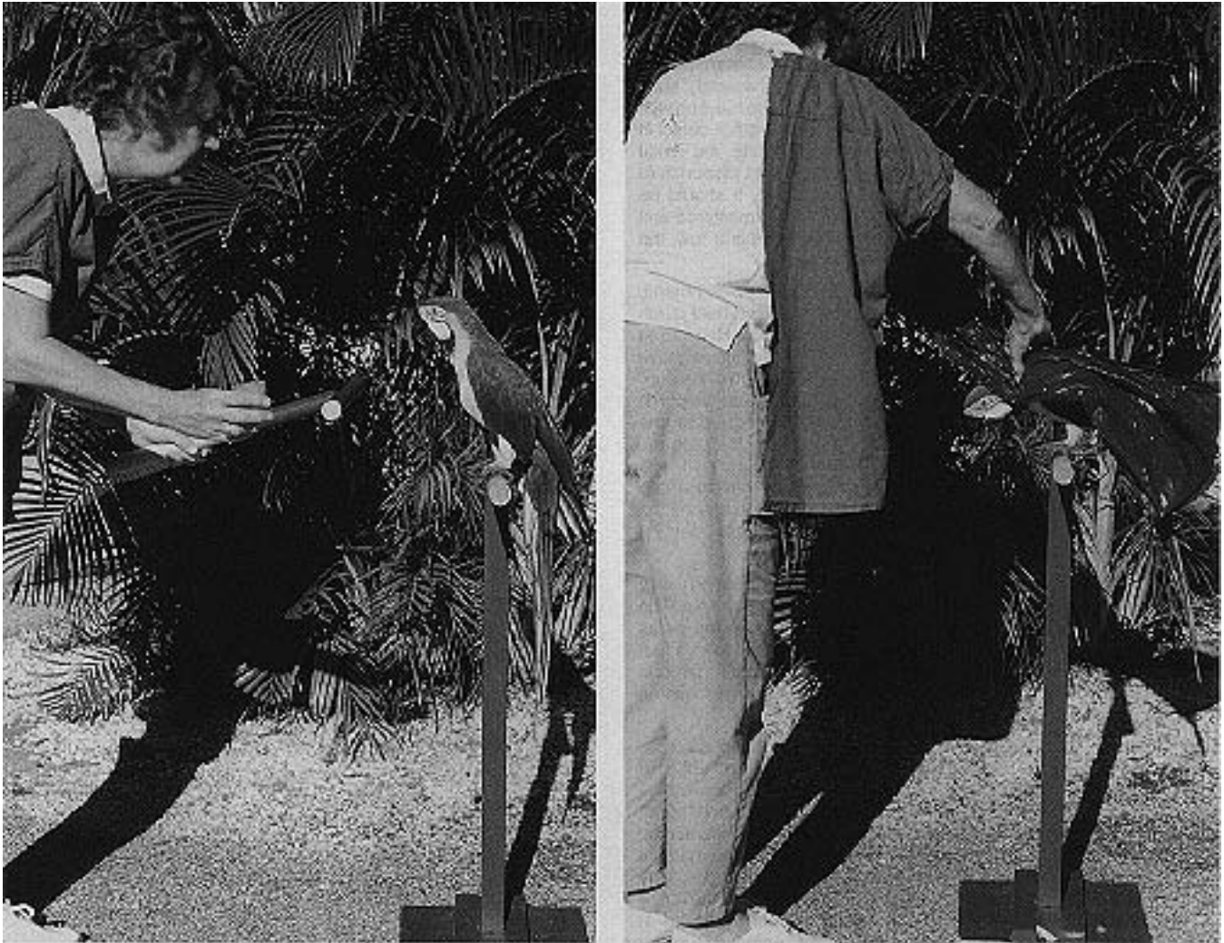
FIG 4.4 To be the most effective, training sessions should occur at the same time each day and there should be consistency with respect to the routine. In this case, an adult Blue and Gold Macaw is being taught to step onto a perch and to allow itself to be stroked. The bird appears to prefer blue colors and the perch and clothing of the trainer reflect this preference. A perch is presented and the command is given to “step up.” A blue plastic bag is used to facilitate contact with the bird as the initial step to acclimate the bird to being stroked.

Only one person should be the trainer for at least the first three to four weeks, but a tape recorder, video camera or coach may help monitor communication between the trainer and the bird. Methods for training problem birds are similar to those for neonates. Simple, one-word commands in a relatively strong, authoritative voice should be given only once and only when in training. The trainer must be ready to demonstrate appropriate behaviors and must have positive reinforcers chosen and ready to be delivered. To be effective, behavior correction sessions must occur four times each week for a minimum of 15 minutes for each session. Practice sessions should take place in the training area only and should be uninterrupted.