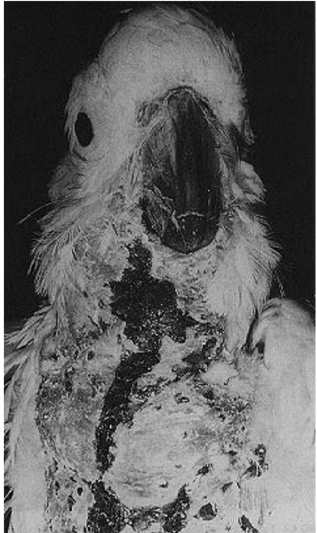
FIG 4.5 Some cases of psychological feather picking can progress to the point of self-mutilation.

Screaming is a serious behavioral problem, especially in cockatoos and macaws. The time of day and circumstances associated with screaming should be charted for several weeks in order to arrange training or play sessions for the time just before the