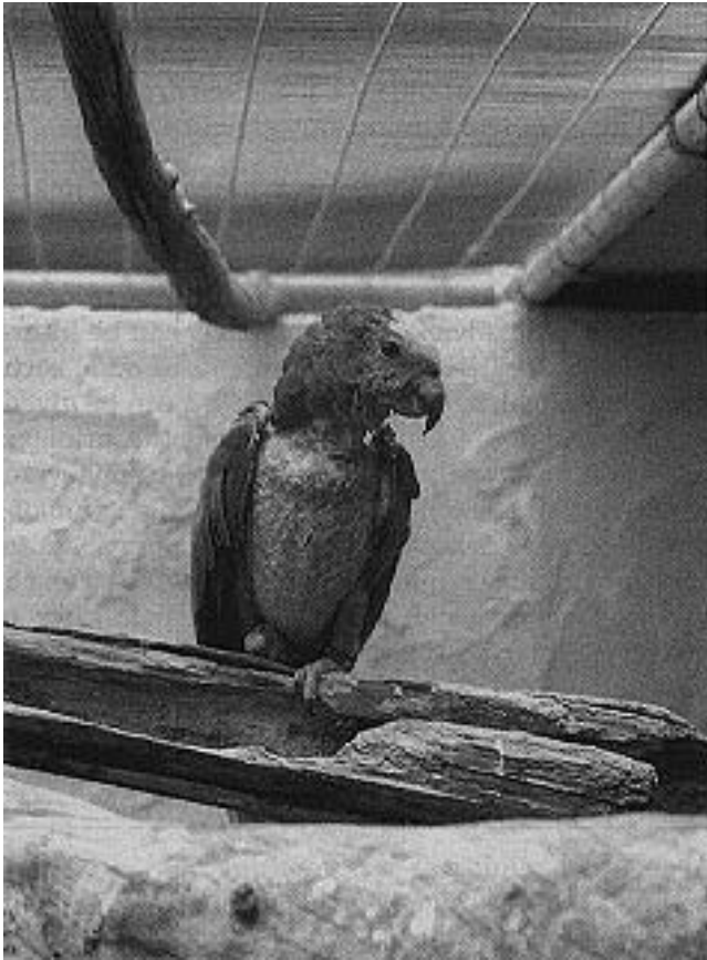
FIG 4.3 A diagnosis of psychological feather picking should be reserved for cases in which no other medical cause for the abnormality can be identified. Psychological feather picking is particularly common in African Grey Parrots but can occur in any species.

without a variety of socializing experiences will be less tolerant and more fearful of new situations as adults. These birds rarely enjoy handling or close contact with people.