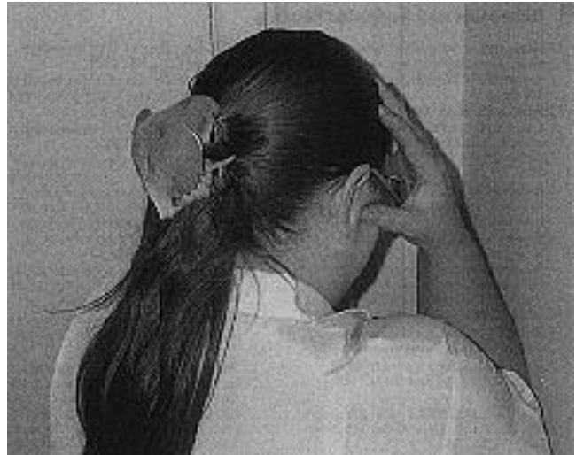
FIG 4.6 Masturbatory activity is common in imprinted adult birds that accept a client, enclosure furniture or toys as a mate.

A bird that refuses to leave its enclosure should be fed just outside the enclosure door. The food should be left out for 15 minutes and then removed. Once the