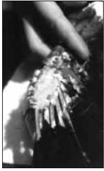
Electus with severe xanthomatosis on the wing, before Harrison’s.

The choice of fluid for rehydration therapy should be as carefully considered in birds as it should be in mammals. Lactated Ringer’s solution (LRS) is perhaps the