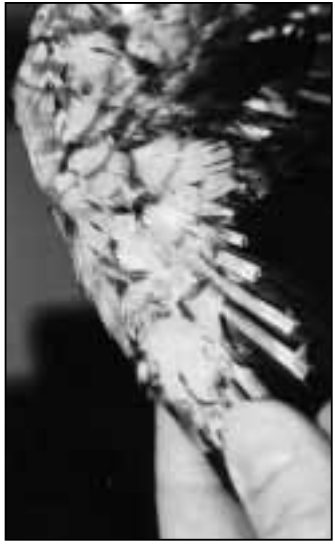
Electus, six months after switching to Harrison’s.

ficulties in converting birds, I have had nothing but success.