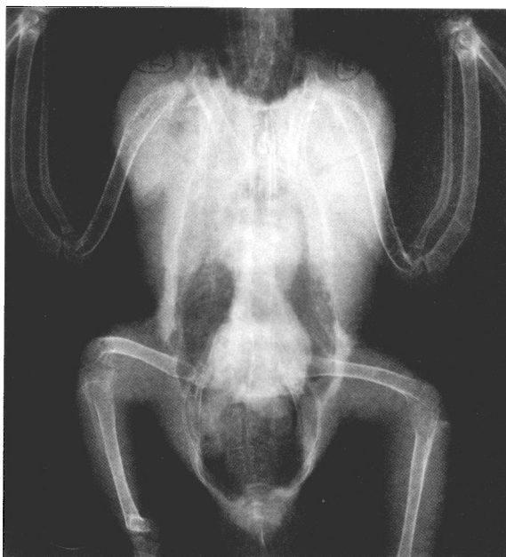
FIG 1: Ventrodorsal view of a grey parrot, taken with the carina superimposing the notarium and the wings and legs slightly extended. Both radii and ulnae and the right tibiotarsus can be seen to have been deformed by juvenile osteodystrophy

The following bones were selected for examination: furcula (fused clavicles), carina (keel), ribs, humerus, radius, ulna and pelvis, including the synsacrum, femur and tibiotarsus. The radiographs were examined for signs of skeletal diseases and, if necessary, comparing them with radiographs and skeletons of wild-caught, imported, adult grey parrots.